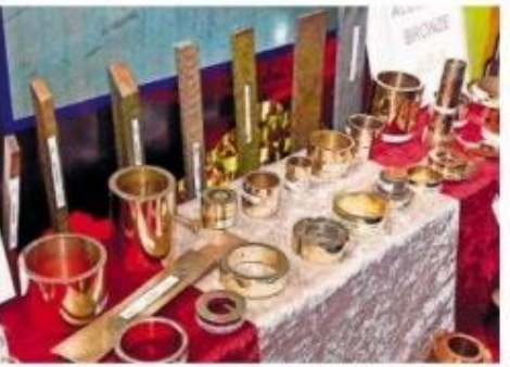
பல்வேறு உலோக பொருட்களின் அரங்குகள்.