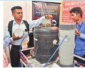
Visitors at one of the stalls