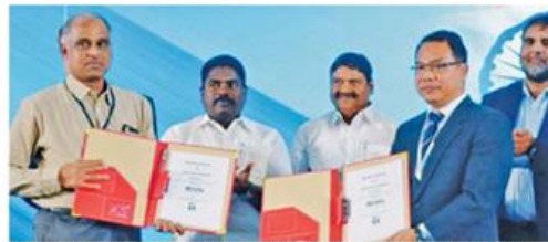
Minister for Industries, M C Sampath and Minister for Rural Industries and MSME, P Benjamin, at the inauguration of the International Engineering Sourcing Show (IESS) at Codissia trade fair complex in Coimbatore on Wednesday.

He said, "This year's IESS is taking place in the background of challenging global economic envi-