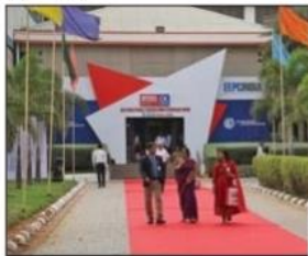
கோவை கொடிசியா கண்காட்சி வளாகம். பல்வேறு இன்ஜினியரிங் பொருட்கள்.

கொல்கத்தாவை தலைமையிடமாக கொண்டு இயங்கும் இந்திய இன்ஜினியரிங் பொருட்கள் ஏற்றுமதி மேம்பாட்டுக் கழகம் (இஐபிசி இந்தியா) சார்பில் ஆண்டுதோறும் சர்வதேச இன்ஜினியரிங் பொருட்கள் உற்பத்தி கண்காட்சி (இஐஎஸ்எல்) நாட்டின் பல்வேறு பகுதிகளில் நடத்தப்படுகிறது. இந்த கண்காட்சியில், சர்வதேச அளவில் புகழ்பெற்ற நிறுவனங்களுடன் இந்திய இன்ஜினியரிங் உற்பத்தி நிறுவனங்கள் ஒப்பந்தம் மேற்கொண்டு தொழிலை மேம்படுத்தவும், நம் நாட்டின் பொதுத்துறை நிறுவனங்களுக்கு தேவையான பொருட்களை உற்பத்தி செய்வதற்கான ஆர்வத்தை பெறவும், தற்போதைய தொழில் சூழ்நிலையை புரிந்துகொண்டு, அதற்குத்தகுந்தபடி தொழிலை அறிவிருத்தி செய்யவும் வாய்ப்புகள் உருவாகின்றன.