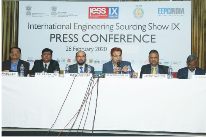
సమావేశంలో ఈఈపీసీ ప్రతినిధులు