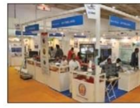
கண்காட்சியில் உள்ள ரோபோ. கண்காட்சியில் உள்ள இடம் பெற்றுள்ள அரங்குகள்.

இன்ஜினியரிங் துறையில் சர்வதேச அளவில் சீனா 80 சதவீதம் பங்களிப்பு செய்தால், நாம் 10 சதவீதம் மட்டுமே பங்களிப்பு செய்கிறோம். கரோனா காரணமாக நம் நாட்டின் இன்ஜினியரிங் துறைக்கு வாய்ப்புகள் அதிகரிக்கும். உள்வட்ட உட்படி துறையிலும் இத்தியாயவக்கான வாய்ப்பு அதிகரிக்கும். குறிப்பாக தமிழகத்தைச் சேர்ந்த உள்வட்ட உட்படி துறையினர் இந்த வாய்ப்பை பயன்படுத்திக் கொள்ள முடியும். சீனாவில் இருந்து இருக்குமதி செய்யப்பட்ட இயந்திரங்கள் வந்துள்ளன. ஆனால், அவற்றை இயக்குவதற்கு சீன இன்ஜினியர்கள், கரோனா பாதிப்பால் இங்கு வர வதற்கு சிக்கல் உள்ளது. ஜூன் மாதத்திற்குள் இந்த பிரச்சனை சீராகம் என்று நம்புகிறோம். இவ்வாறு அவர் கூறினார்.