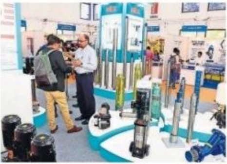
இன்ஜினியரிங் தொழில் திறவாண்கள் அரங்குகள்.