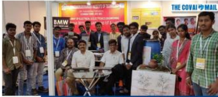
சர்வதேச பொறியியல் உற்பத்தி கண்காட்சியில் பங்கேற்ற கே.ஐ.டி மாணவர்கள்

கொடைவழி கண்ணம்பாளையத்தில் உள்ள கலைஞர் கருணாநிதி தொழில்நுட்பக் கல்லூரியின் பயிலும் பல்வேறு துறைகள் சார்ந்த மாணவ, மாணவிகள் சர்வதேச பொறியியல் உற்பத்தி கண்காட்சி INTERNATIONAL ENGINEERING SOURCING SHOW (IESS) கொடிசியா வந்திக் கண்காட்சி வளாகத்தில் பல்வேறு புதிய அறிவியல் கண்டுபிடிப்புகளை வெளிப்படுத்தினார்கள்.