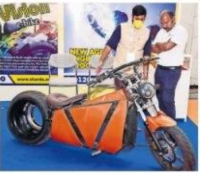
கண்காட்சியில் இடம்பெற்ற இ-ஸ்பை.