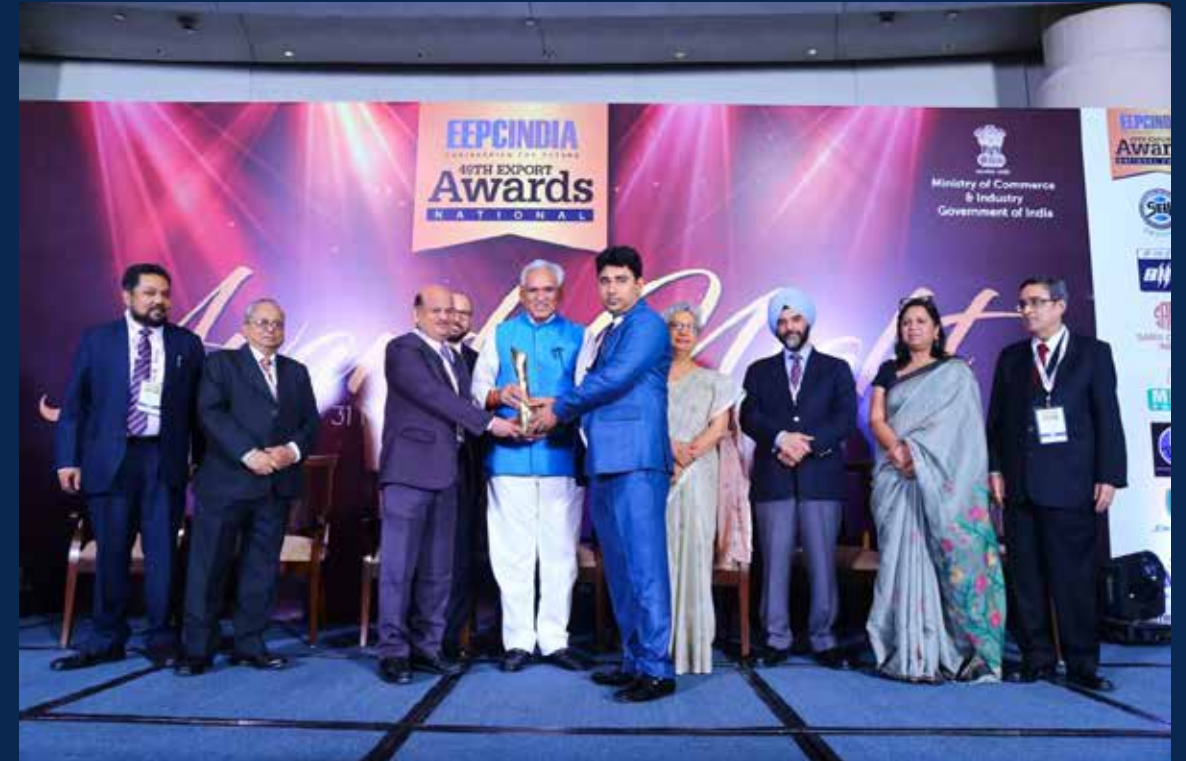
Mr C R Chaudhary, India's Minister of State for Commerce and Industry (centre), giving away the trophies at the 49th EEPC India National Export Awards