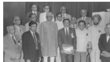
Above, India's President, Neelam Sanjiva Reddy, and Commerce and Industry Minister, Mr Pranab Mukherjee with EEPC India officials at the 25th anniversary celebrations in 1980. Right: Past Chairmen and an Executive Director of EEPC India at the Golden Jubilee celebrations in 2005 with India's President, Dr A P J Abdul Kalam and the Commerce and Industry Minister Mr Kamal Nath