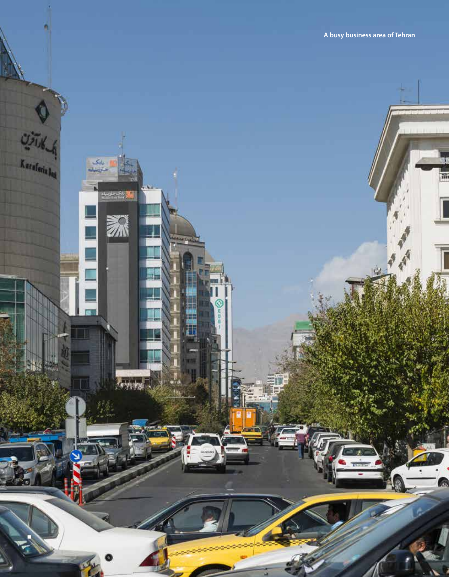
A busy business area of Tehran