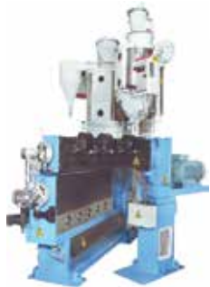
Wire Cable Extrusion Line