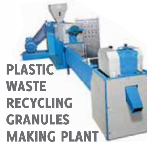
PLASTIC WASTE RECYCLING GRANULES MAKING PLANT