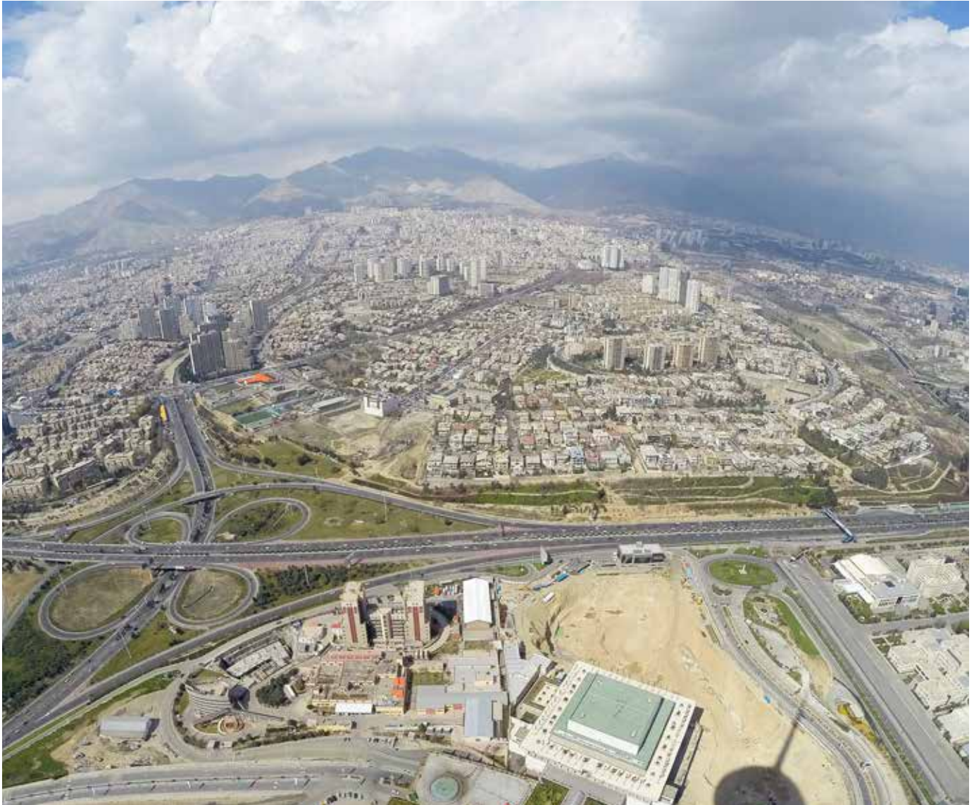
Tehran skyline seen from Milad Tower, also known as Tehran Tower