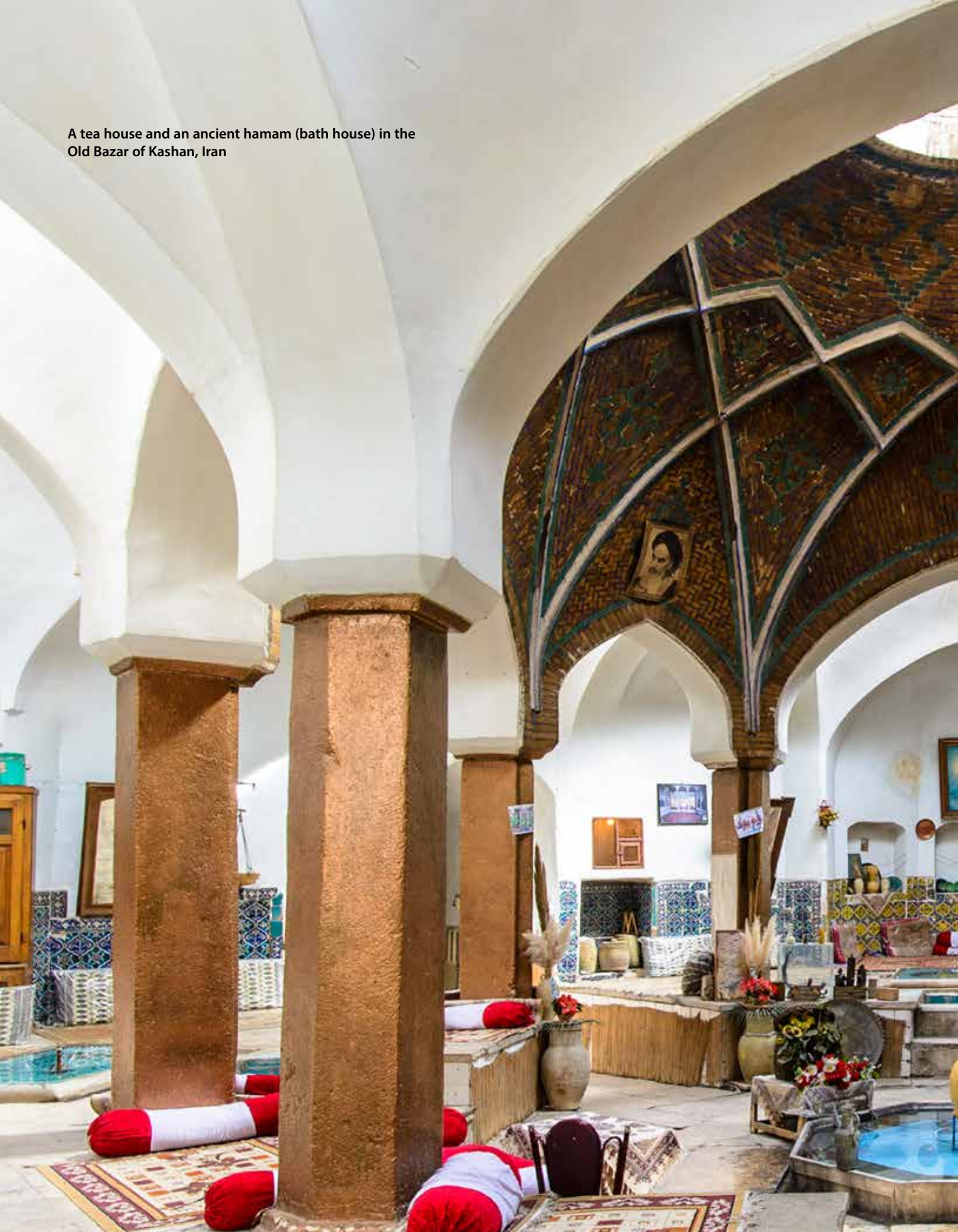
A tea house and an ancient hamam (bath house) in the Old Bazar of Kashan, Iran