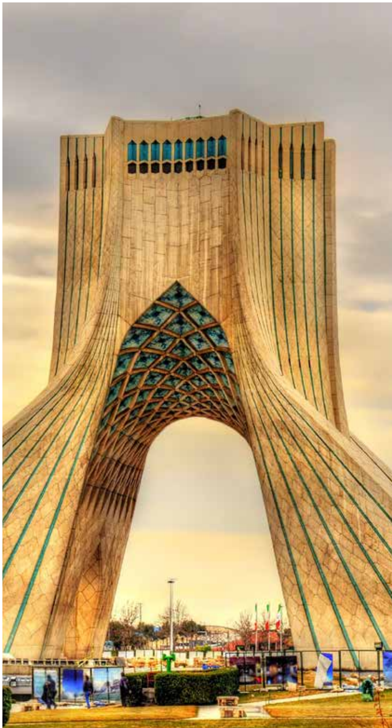
The Azadi Tower in Tehran