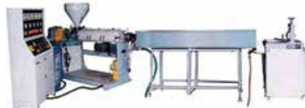
PVC FLEXIBLE PIPE MAKING PLANT