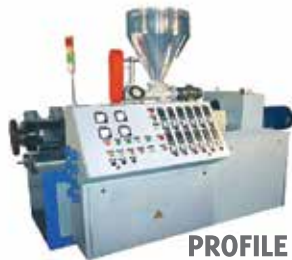
PROFILE EXTRUSION LINES