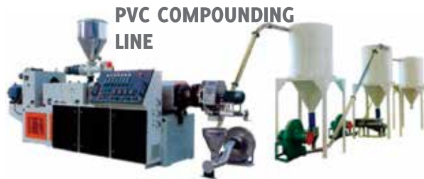
PVC COMPOUNDING LINE