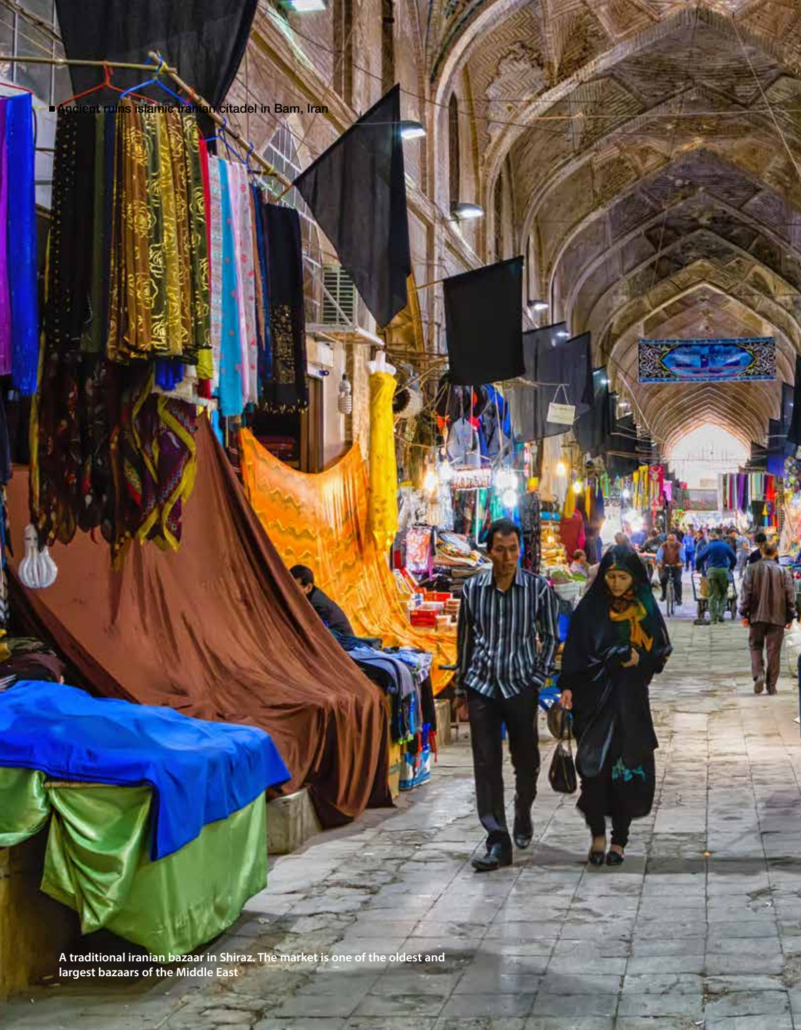
A traditional iranian bazaar in Shiraz. The market is one of the oldest and largest bazaars of the Middle East