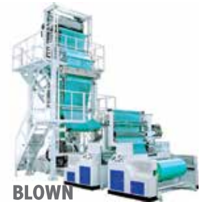
BLOWN FILM MAKING PLANT