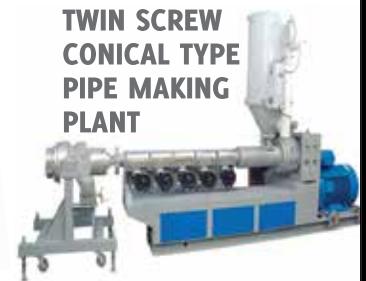
TWIN SCREW CONICAL TYPE PIPE MAKING PLANT