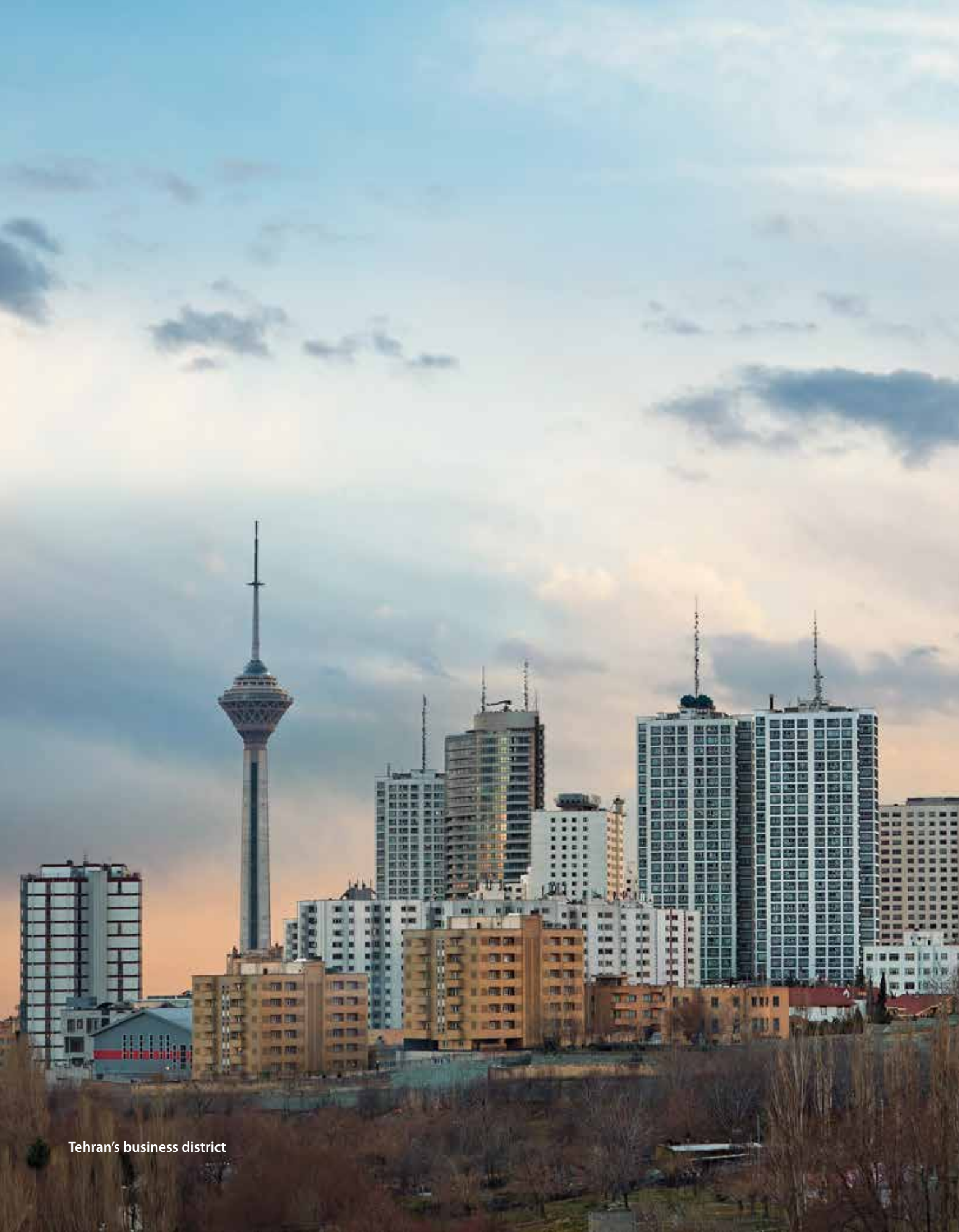
Tehran's business district