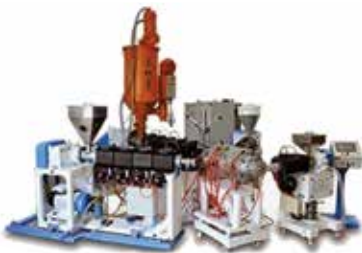
HDPE PIPE MAKING PLANT