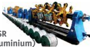
ACSR (Aluminium) CONDUCTOR MAKING PLANT