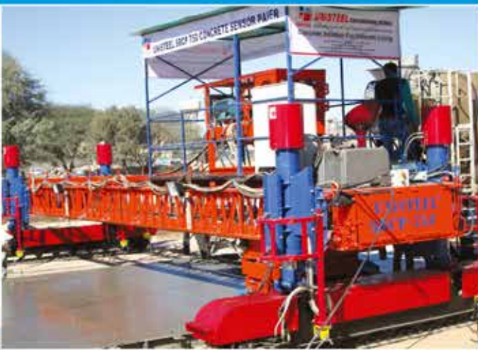
Working on Track Chain SRCP-750

UNiSTEEL ENGINEERING WORKS Plot No. 79/B, Phase-I, Opp. Water Tank, G.I.D.C., Vatva, Ahmedabad-382 445. Gujarat INDIA. Ph.: 0091 79 25895111, 25895546 | Fax: 0091 79 25895553 E-mail: unisteel@unisteel.net