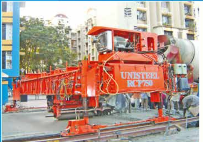
Concrete Paver For Roads & Airport RCP-750