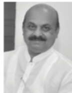
Incumbent government will further hike it from Rs 30 lakh to Rs 50 lakh. Besides, the government will ensure appointment of the family members to jobs on compassionate grounds and will take care of their welfare with utmost sympathy. You protect the forest, the government will

protege you," he said. Noting that the government has plans to increase the forest cover from 21 per cent to 30 per cent, the chief minister pointed out that Karnataka has over four lakh hectares of barren land and afforestation can be done to increase the forest area. Karnataka was the first state in the country to present the environment budget and Rs 100 crore has been allocated, Bommai said. This year, an afforestation program will be taken up at a cost of Rs 100 crore. A special plan has been chalked out by the forest department to conserve the ecologically sensitive areas. The department has taken special interest to protect natural resources and