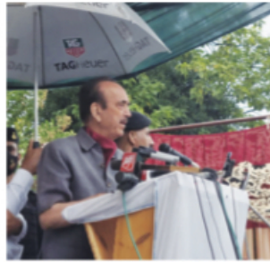
Former Jammu and Kashmir Chief Minister and veteran politician Ghulam Nabi Azad addressing a public rally at Dak Bungalow in north Kashmir's Baramulla district.