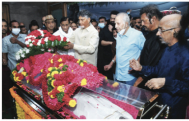
Former Andhra Pradesh Chief Minister N Chandrababu Naidu paying tribute to the mortal remains of veteran actor and former Union Minister, Krishnam Raju at his residence who died due to cardiac arrest at AIG Hospitals in the early hours of Sunday.