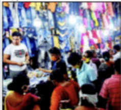
পুজোর খরচ বাঁচানোর উপায়