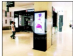
বিভিন্ন মেট্রো স্টেশানে বসানো হবে ডিজিটাল স্ট্যান্ডিস