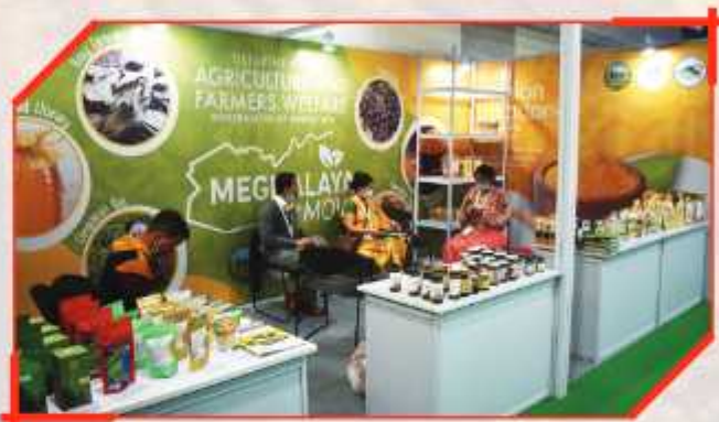
Government of Meghalaya