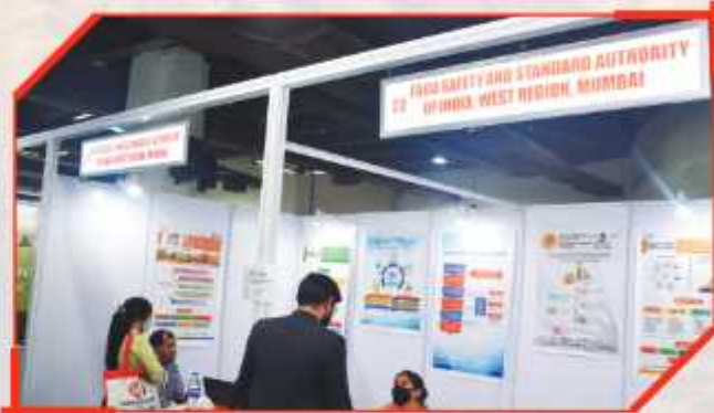
FSSAI - Food Safety and Standards Authority of India, Govt. of India