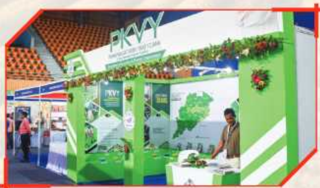
Government of Odisha