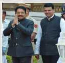
H. E. Governor Rao & CM Fadnavis of Maharashtra