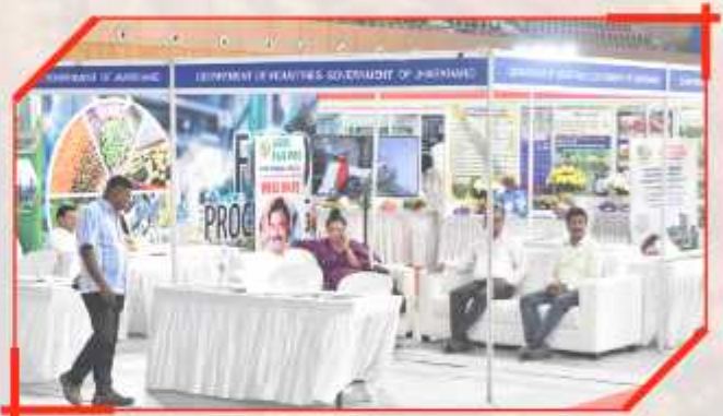
DEPARTMENT OF INDUSTRIES, GOVERNMENT OF JHARKHAND