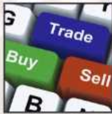
Associations & Chambers