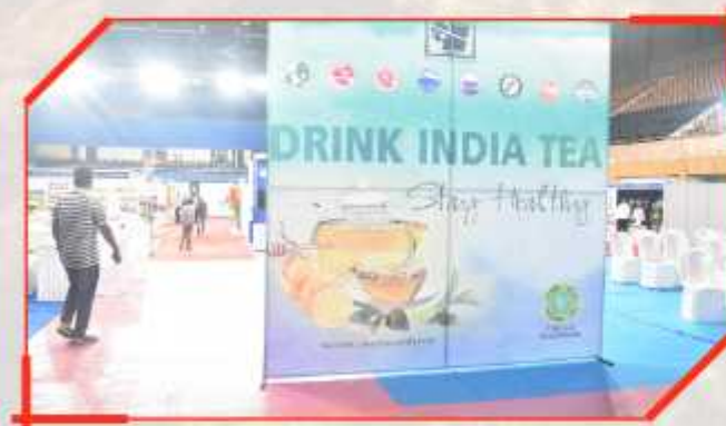
TEA BOARD OF INDIA