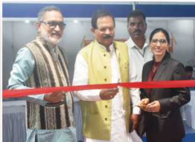
Hon Union Minister of State, Shri Shripad Naik ji inaugurating the event

We are back for the 24th year in succession. F & B Pro India has over the last so many editions featured a number of Government of India boards, like those for Coir, Jute, Coffee, Coconut, etc. besides being supported by the Union Ministry of Food Processing Industries and chambers of commerce, professional / industry / trade associations, newspapers and publications. According to McKinsey & Co, the food retail sector in India is likely to grow to US $ 150 Billion by 2025, accounting for a large chunk of the world food industry, estimated to be US $ 400 Billion by then. All of which makes being at F & B Pro India - an absolute imperative.