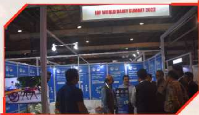
National Dairy Development Board