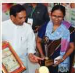
Sri Lankan Minister & Kerala Health Minister