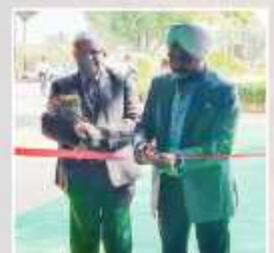
Hotels & Restaurants Association President