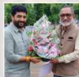
Shri Murlidhar Mohol, Union Minister & Trinity Chairman