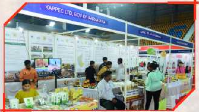
Government of Karnataka