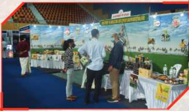
Government of Kerala