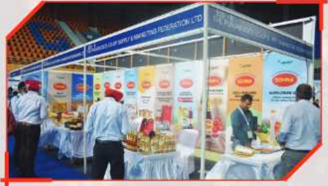
Government of Punjab