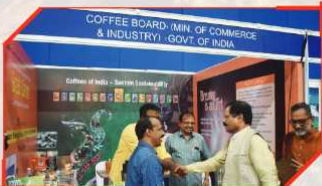
Coffee Board, Government of India Ministry of Industry & Commerce