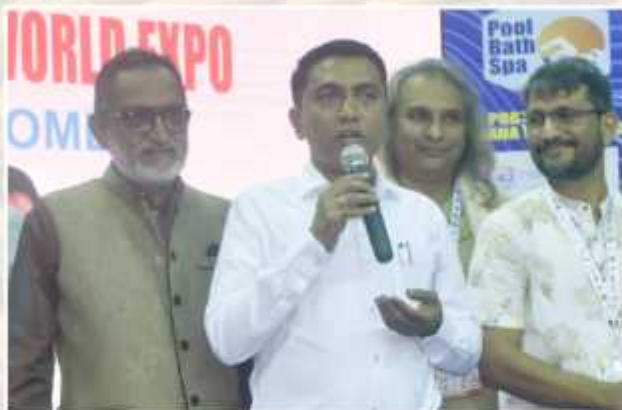
Dr. Pramod Sawant ji, Chief Minister of Goa speaking at the last event.