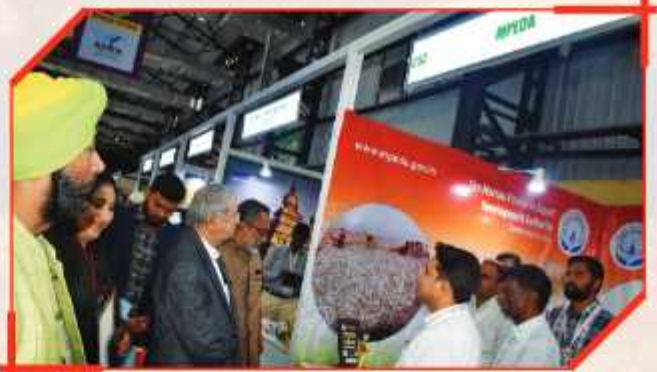
MPEDA Pavilion - Marine Products Export Dev. Authority, Ministry of Industry & Commerce