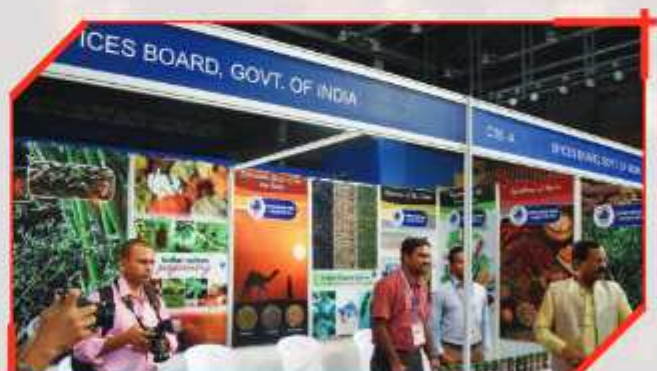
Spices Board, Government of India Ministry of Industry & Commerce