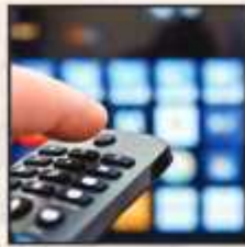
TV & Cable Channels