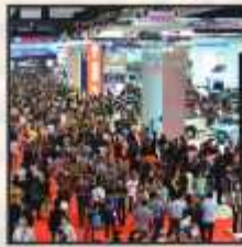
In Venue Displays