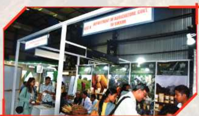
Government of Sikkim