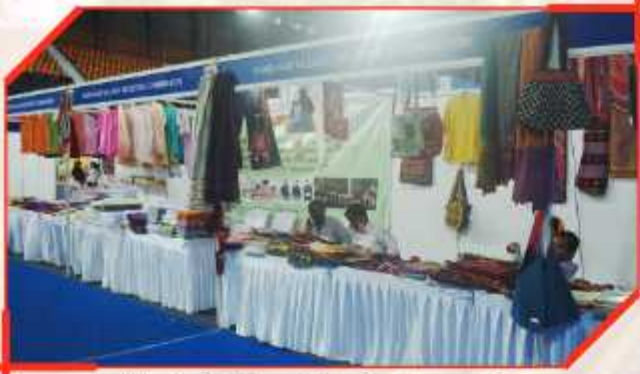
Khadi & Village Industries Corporation