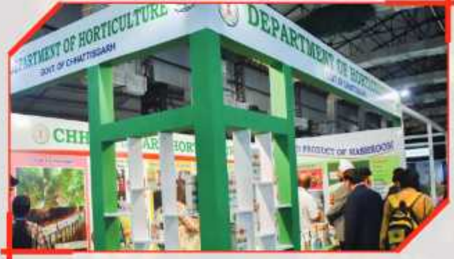
Government of Chhattisgarh - Horticulture Dept.