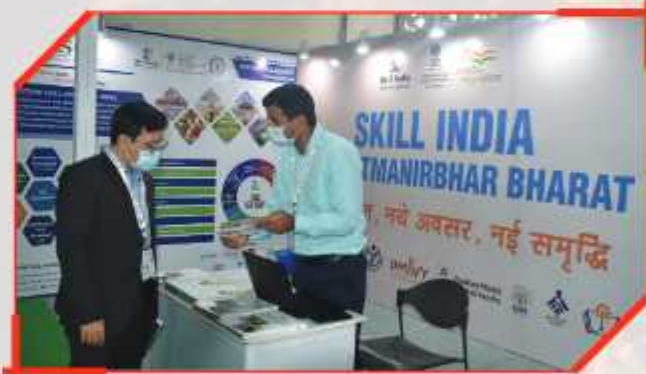
Skill India Atmanirbhar Bharat