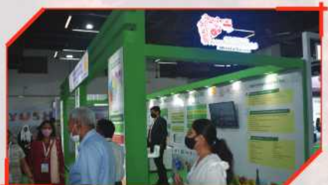
Government of Maharashtra - MIDC