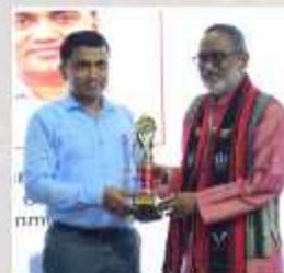
Hon Chief Minister of Goa & Impex Chamber Mg. Dir.