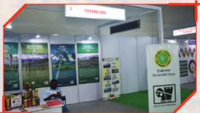
Tea Board, Government of India Ministry of Industry & Commerce