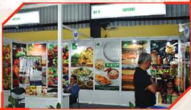
APEDA Pavilion - Agricultural Products Export Dev. Authority, Ministry of Industry & Commerce