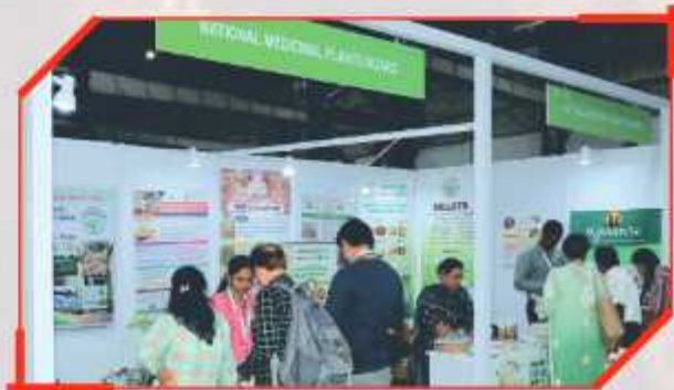
National Medicinal Plants Board of India - NMPB