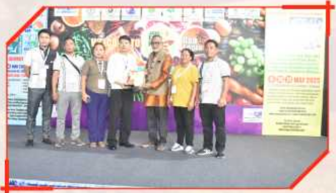
COMMERCE & INDUSTRIES DEPARTMENT, GOVERNMENT OF MIZORAM