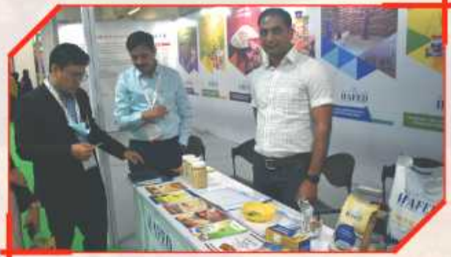
Government of Haryana, HAFED