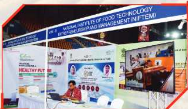
Ministry of Food Processing, Govt of India - National Institute of Food Tech, Entrepreneurs & Mgmt - NIFTEM