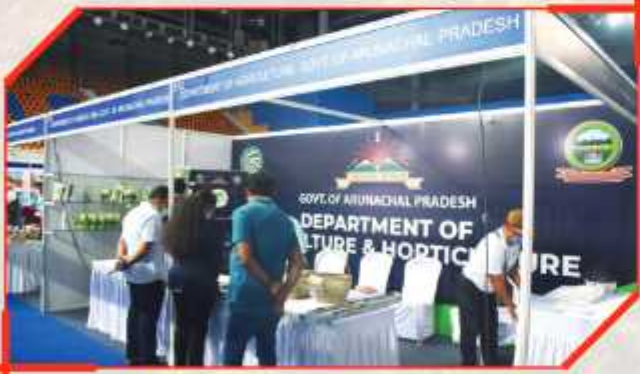
Government of Arunachal Pradesh