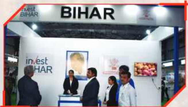
Government of Bihar