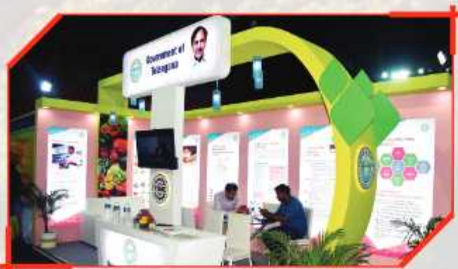
Government of Telangana