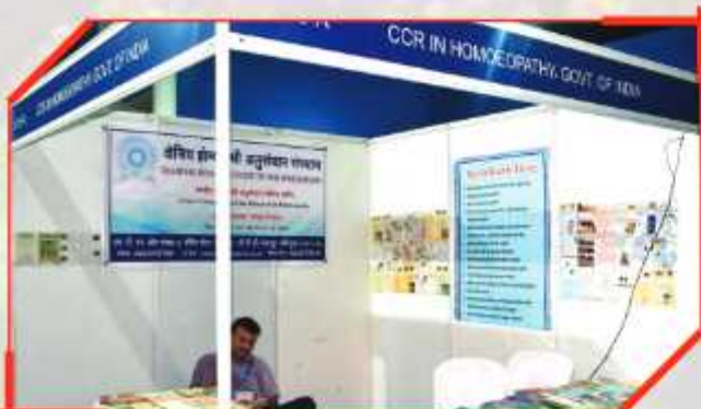
Central Council for Research in Homoeopathy - CCRH