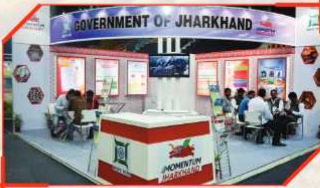
Government of Jharkhand