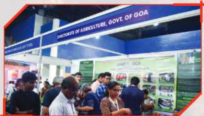
Government of Goa