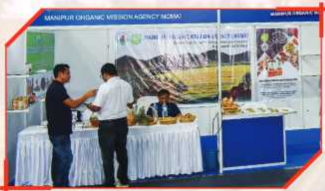
Government of Manipur - MOMA