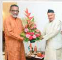
Governor of Maharashtra & Impex Chamber Mg. Dir.