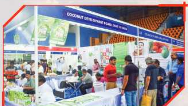
Coconut Development Board, Govt of India Ministry of Agriculture