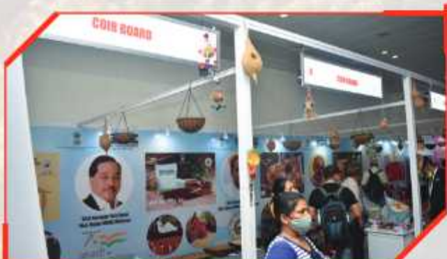
Coir Board, Government of India Ministry of MSME