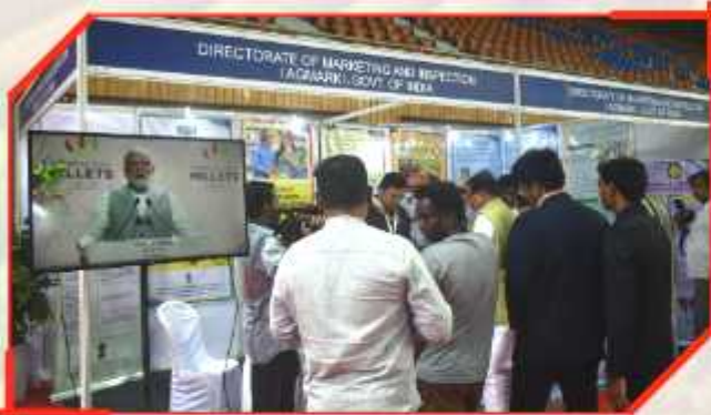
Directorate of Marketing & Inspection (AGMARK), Govt. of India