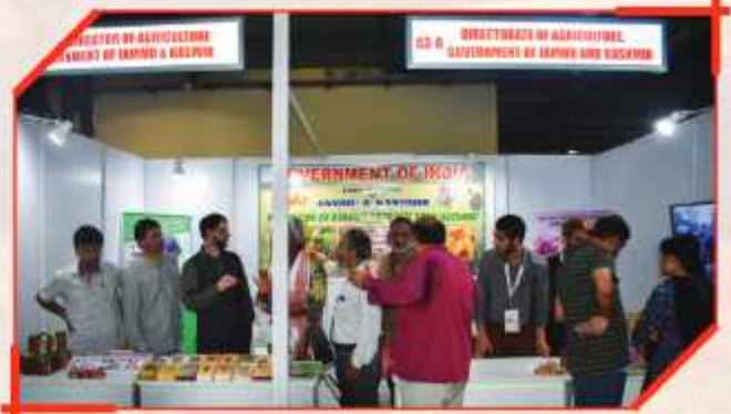
Government of Jammu & Kashmir