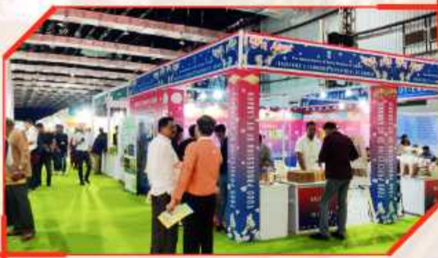
Food Processing Of UT Ladakh