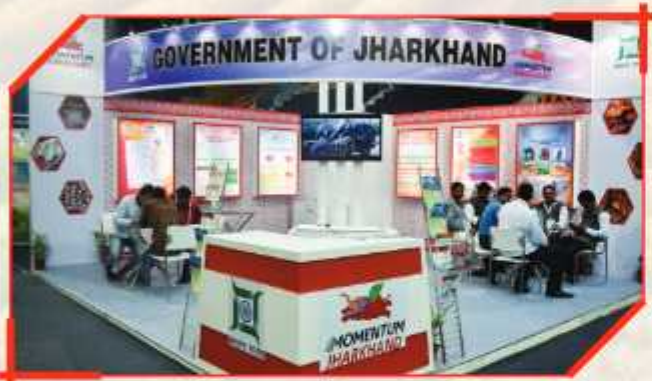
AGRICULTURAL AND PROCESSED FOOD PRODUCTS EXPORT DEVELOPMENT AUTHORITY