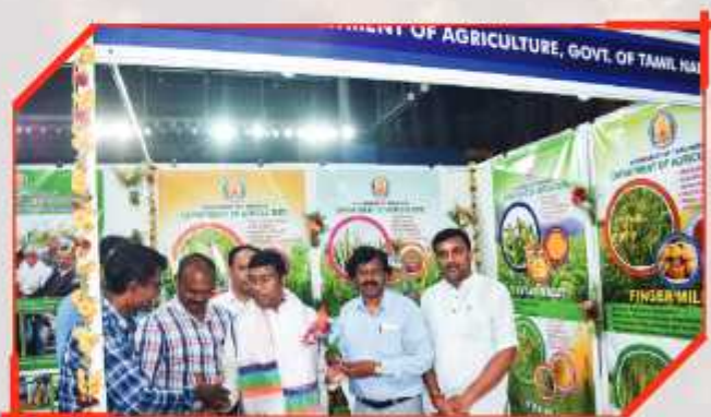
Government of Tamil Nadu