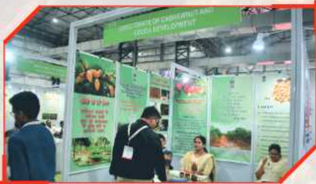
Directorate of Cashewnut and Cocoa Development