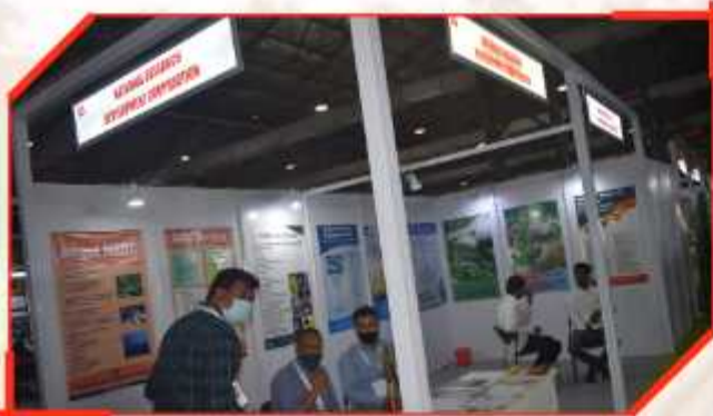
National Research Development Corporation