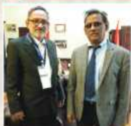
President of Mauritius & CMD of Impex Chamber