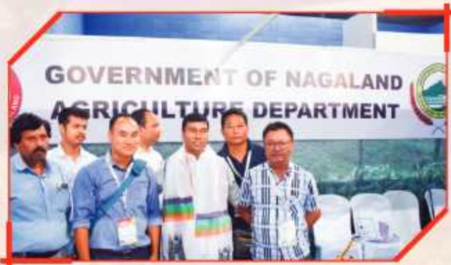
Government of Nagaland