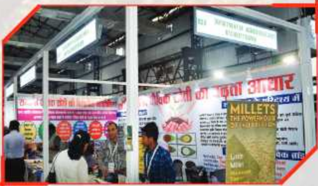
Government of Chhattisgarh - Agriculture Dept.