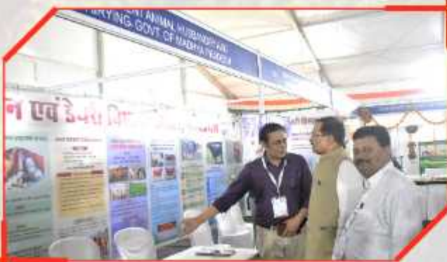
Government of Madhya Pradesh