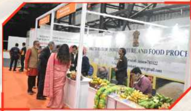
Government of Assam - PKYY & MOVCD