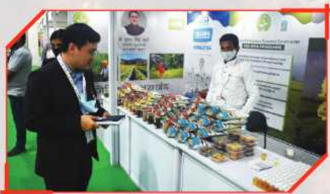
Government of Uttarakhand