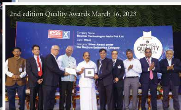
2nd edition Quality Awards March 16, 2023