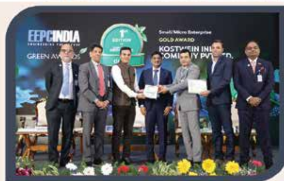
Gold Award in Small Enterprise Category: KOSTWEIN INDIA COMPANY PVT. LTD.