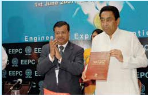
Mr Kamal Nath, Commerce Minister, releasing a Strategy Paper in New Delhi, 2007