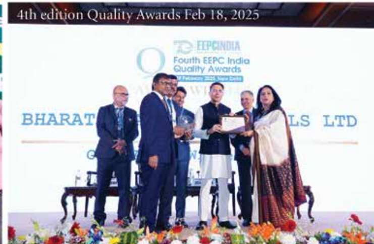
4th edition Quality Awards Feb 18, 2025