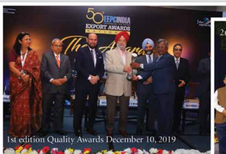
1st edition Quality Awards December 10, 2019

EEPC India Quality Awards was introduced on December 10, 2019 coinciding with the 50th edition of National Awards. So far till 2025 four editions have been held. The award scheme acknowledges companies who have made significant contribution to promoting quality manufacturing.