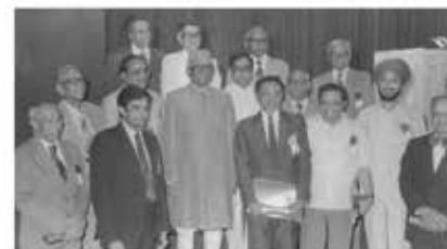
Above, India's President, Neelam Sanjiva Reddy, and Commerce and Industry Minister, Mr Pranab Mukherjee with EEPC India officials at the 25th anniversary celebrations in 1980. Right: Past Chairmen and an Executive Director of EEPC India at the Golden Jubilee celebrations in 2005 with India's President, Dr A P J Abdul Kalam and the Commerce and Industry Minister Mr Kamal Nath