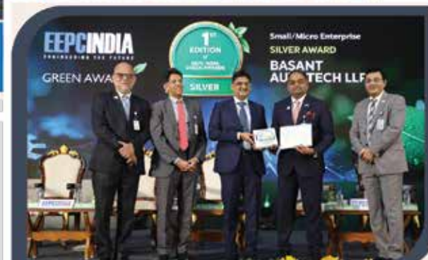
Silver Award in Small Enterprise Category: BASANT AUTOTECH LLP