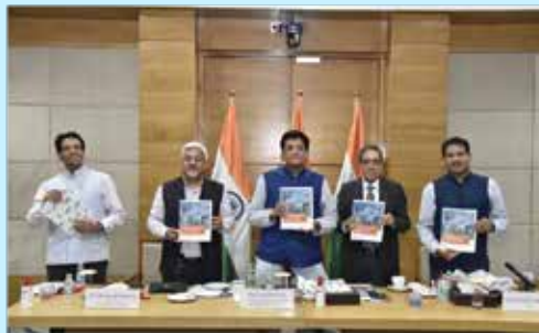
EEPC India Export Strategy Paper released by Hon'ble Minister of Commerce and Industry, Government of India Mr Piyush Goyal on August 29, 2023