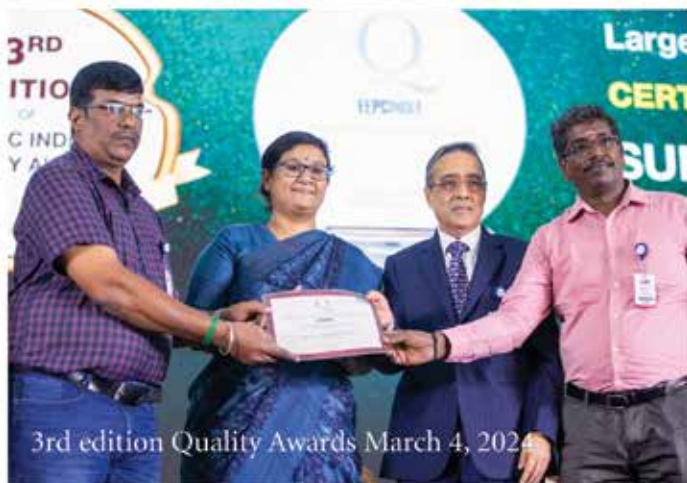
3rd edition Quality Awards March 4, 2024