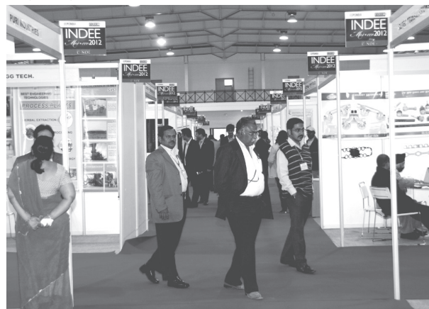
A view of Indian Engineering Exhibition (INDEE) in Casablanca, Morocco