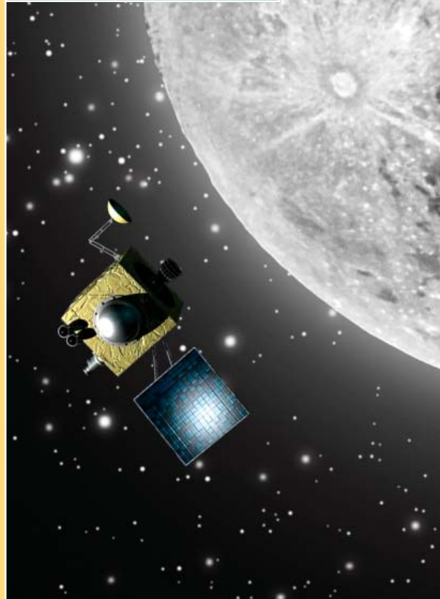
Above, Chandrayan, India's maiden mission to the Moon. Inset, the Brahmos, a most advanced cruise missile