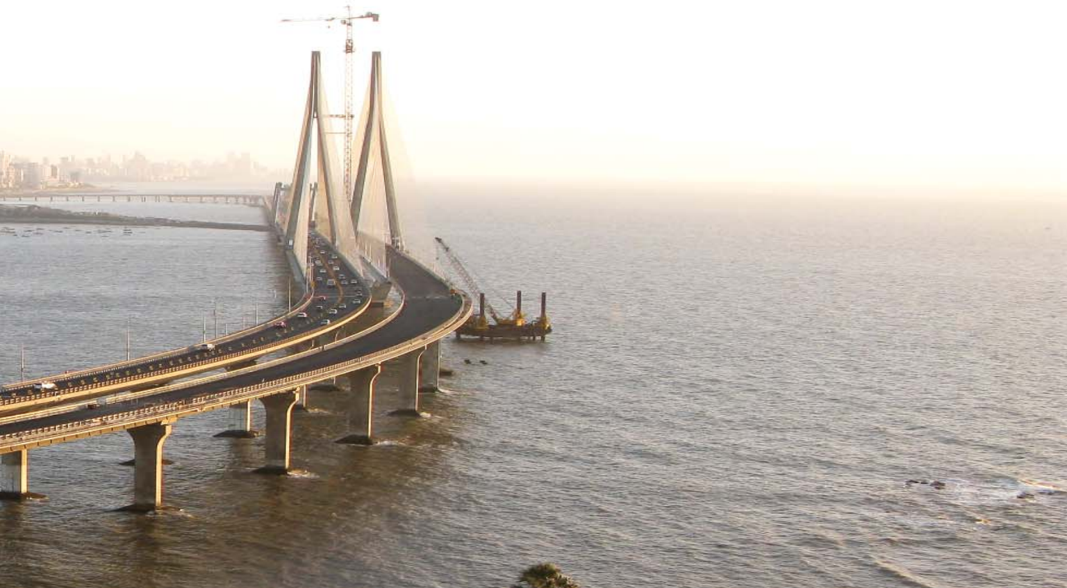
The Bandra-Worli sea link in Mumbai