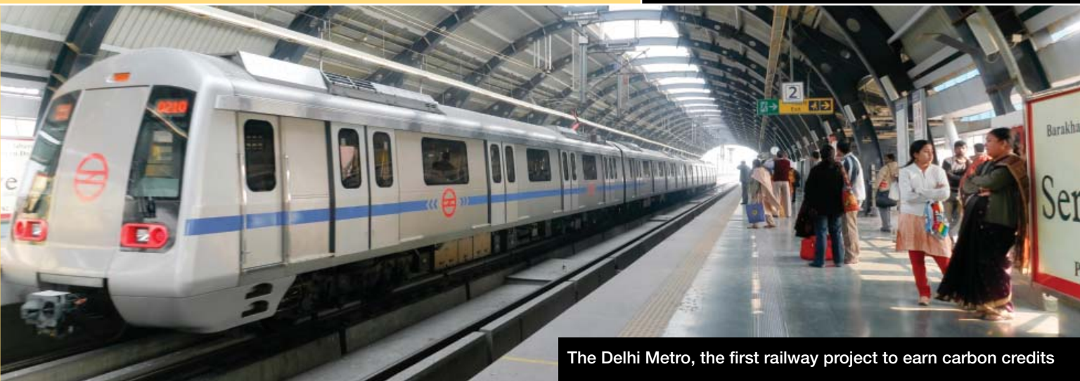
The Delhi Metro, the first railway project to earn carbon credits