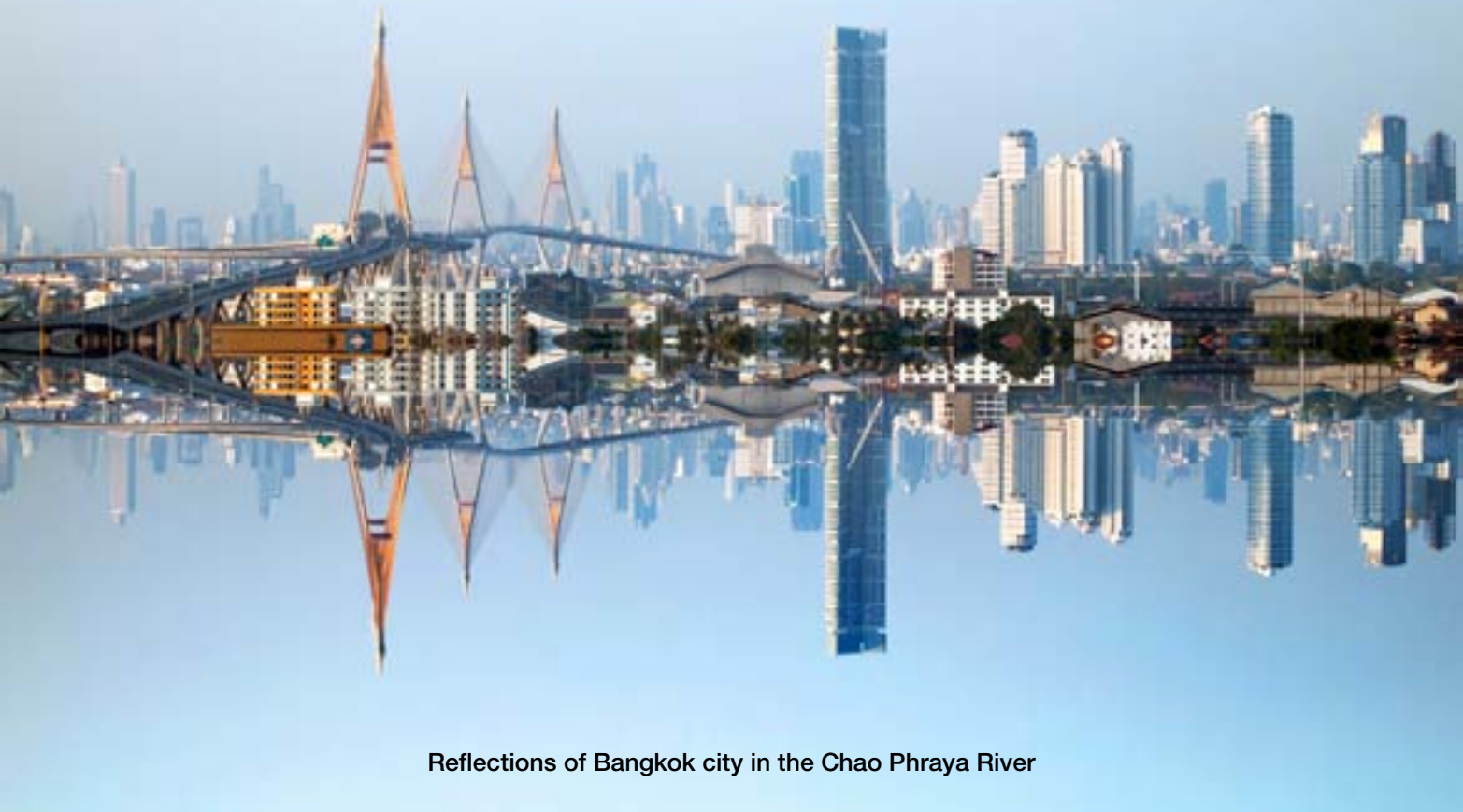
Reflections of Bangkok city in the Chao Phraya River