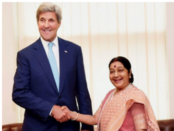
In this picture: External Affairs Minister of India, Smt Sushma Swaraj with US Secretary of State John Kerry

Recognizing the importance of small and medium enterprises (SMEs) to spur growth and create jobs, the two sides committed to creating a platform for sharing of best practices and technology, in addition to access to finance to promote integration of these SMEs in global value chains.