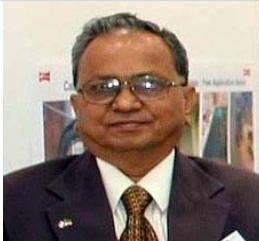
Mahesh K. Desai

In this thirteenth edition of the 'Newsletter on Africa', we focus on the visit made by our Prime Minister to the four countries, namely Kenya, Mozambique, South Africa and Tanzania, of the African continent. The Prime minister candidly said the purpose for these visit is to enhance relations between India and the African countries.