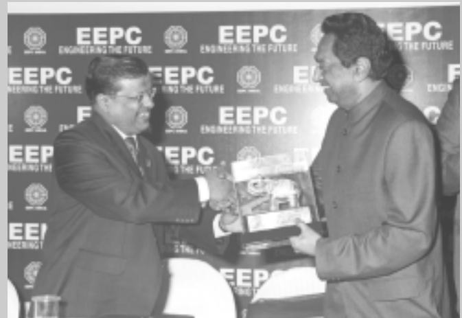
Hon'ble Union Minister of Commerce & Industry Shri Kamal Nath is being presented with a Memento by Shri Rakesh Shah, Chairman, EEPC on the occasion of All India Award Function of the Council held in Mumbai on 13th January, 2006.

Policy Circular No. 48(RE-05)/2004-09 dated 10.02.2006 – Online submission of applications – Procedure for opening Electronic Fund Transfer (EFT) accounts with the DGFT designated banks is time consuming and the mandatory requirement of submitting licence fee through the EFT mode only may be deferred to a future date.