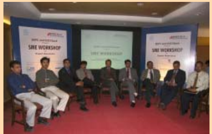
Export Awareness Seminar at Pune on 15th December, 2006

Notification No. 133/2006-Customs dated 30.12.2006 - Changes in Customs Tariff.