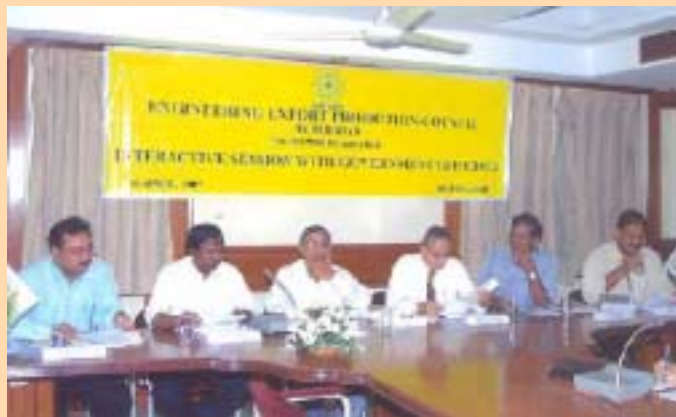
Interactive Session with Government Officials at Hyderabad on 26.04.2007

Circular No. 95/6/2007-ST dated 11.06.07 - Difficulties being encountered by Goods Transport Operators in complying with the provisions of Service Tax.