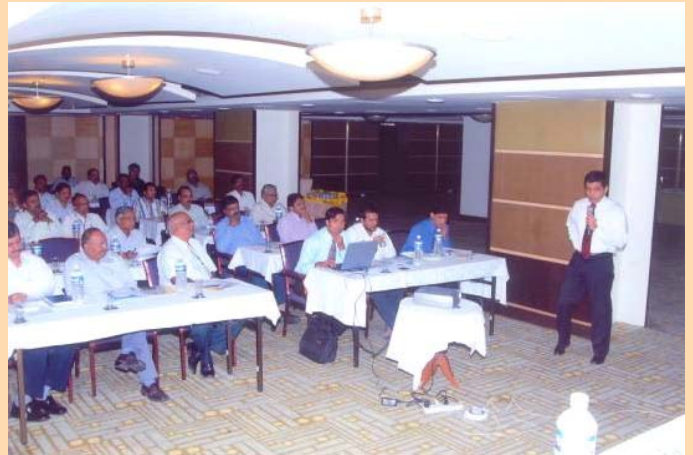
Seminar on Credit Rating held in Hyderabad on 10th August, 2007.

Notification No. 83/2007-Customs (N.T.) dated 16th August, 2007 - CBEC revises tariff value of Brass Scrap (all grades).