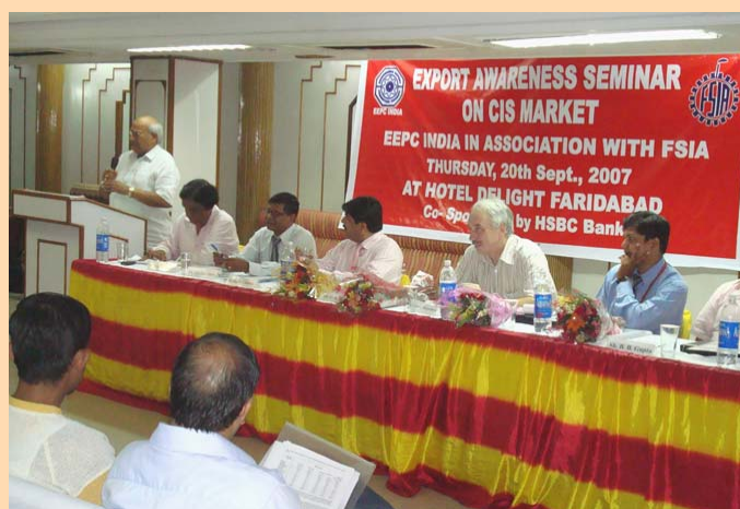
Export Awareness Seminar on FOCUS CIS Market held in Faridabad on 20th September, 2007.

Circular No. 28/2007-Cus. dated 14th August, 2007 – Clearance of imported metal scrap-procedure. Notification No. 102/2007-Customs dated 14th September, 2007 – Exemption granted to Additional Customs Duty on imported goods.