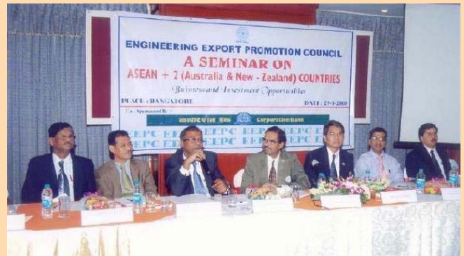
Seminar on Focus ASEAN + 2 (Australia & New Zealand) Countries – Business & Investment Opportunities organised by EEPC (S.R.) on 29th January, 2008 at Bangalore.

Council is going to hold a RBSM between Indian exporters and importers of CIS countries at Jalandhar and Bengaluru on 3rd and 6th March, 2008 respectively. Members are requested to register their participation within 15th February, 2008 .