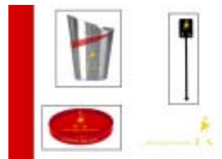
Johnnie Walker item4[2]

Material : S/Steel 304, 0.75 mm thickness NW : 1kg. (Approx.) Size : Top - 19 x18 cm, Bottom-11 x 13 cm, Height – 26 cm Qty : MOQ + 2 price breaks