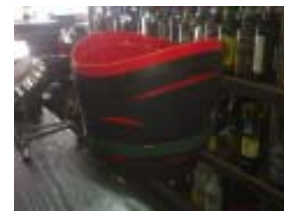
Hoop bucket JW[2]

Needs to fit in a hoop/holder that fixes on to a bar - see attached image – Hanger needs to fit, Outer Diameter of hoop - 255 mm Qty : MOQ +2 price breaks