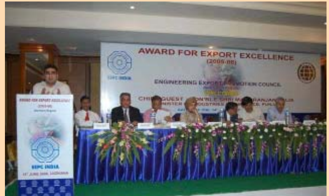
Award for Export Excellence 2005-06 organised by EEPC Northern Region on 14th June, 2008 at Ludhiana, Punjab.

WEEKLY NEWSLETTER VOL. 10 ISSUE NO. 26 JUNE 30, 2008