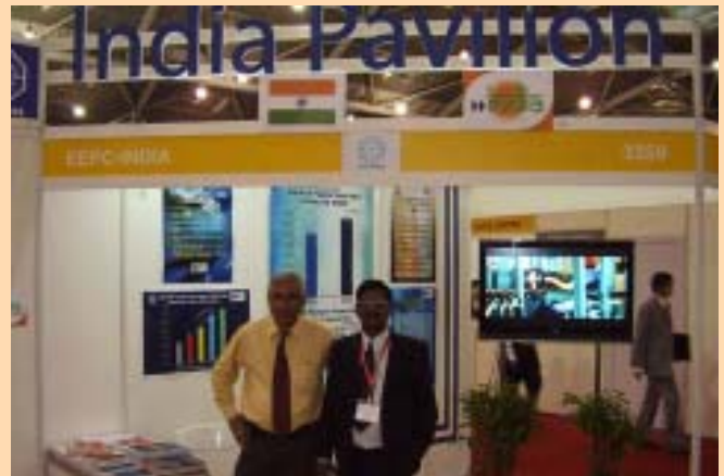
India Pavilion at Pumps & Systems Asia 2008 held at Singapore Expo, in Singapore City, Singapore on 2nd July, 2008.

Policy Circular No. 17 (RE-2008)/ 2004-2009- dated 4th July, 2008 – Submission of multiple application and part payments for claiming deemed export benefits under para 8.3.1 of HBP - Clarification regarding.