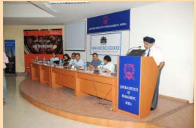
Export Awareness Seminar on Focus ASEAN held in Noida on 11th July, 2008.

WEEKLY NEWSLETTER VOL. 10 ISSUE NO. 30 JULY 28, 2008