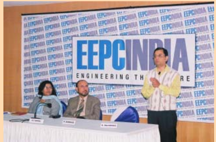
Training Programme on "Filing Procedures" for VAT Refund under New Policy on 12th January, 2009 at Kolkata.