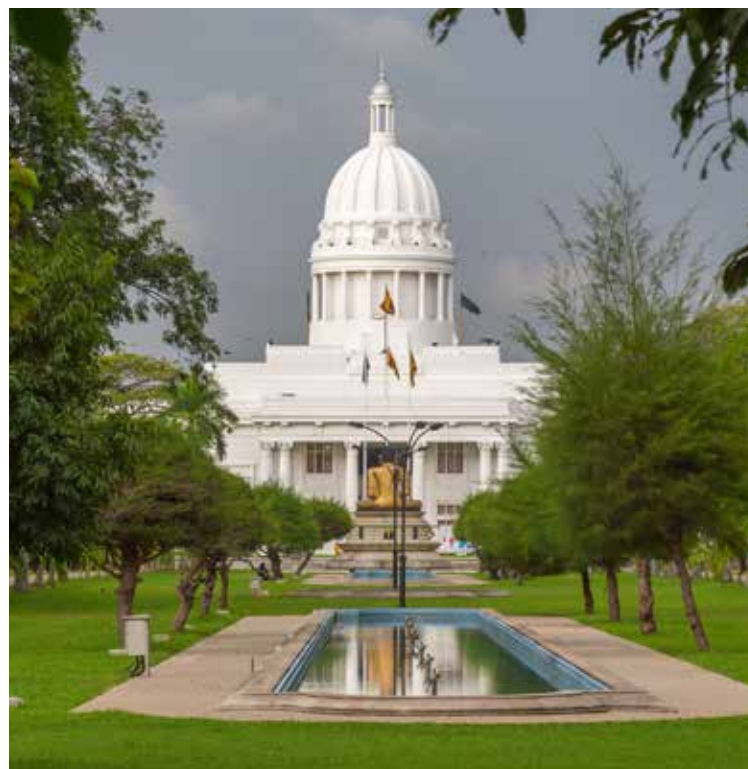
The Town Hall of Colombo

The private sector is the engine of the economy, led by services (telecommunications, transport, international trade, banking, tourism) and export industries (apparel, ceramics, gems, tea). There is a growing IT industry, though it remains small compared to that of India. Sri Lanka offers tax incentives to investors, although the regulations are changing, and it is not clear what incentives will be available to small and medium-sized investors. Infrastruc-