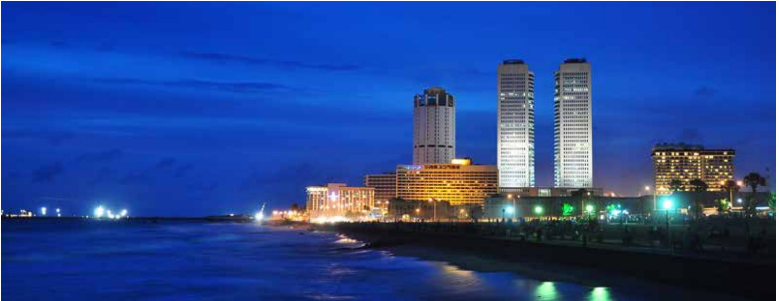
A view of Colombo, capital city of Sri Lanka