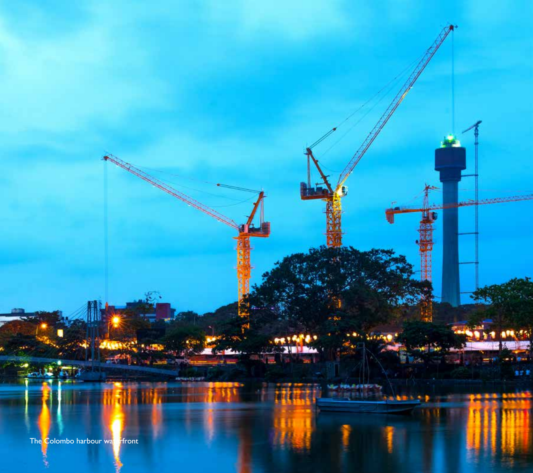
The Colombo harbour waterfront