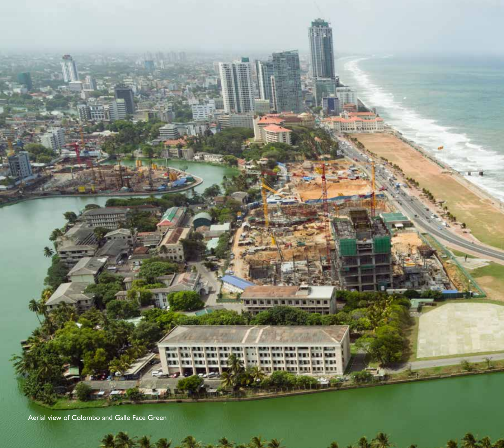
Aerial view of Colombo and Galle Face Green