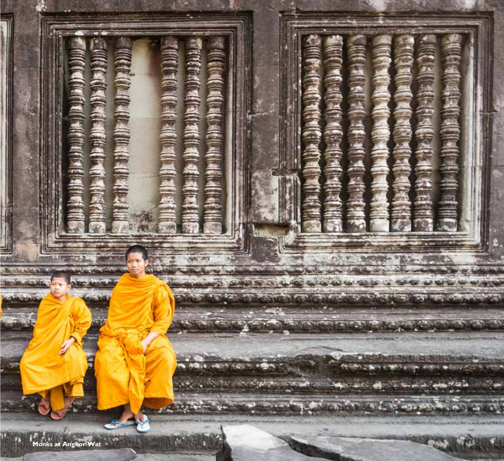
Monks at Angkor Wat