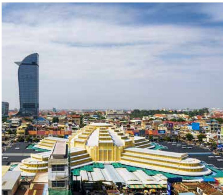
A view of Phnom Penh